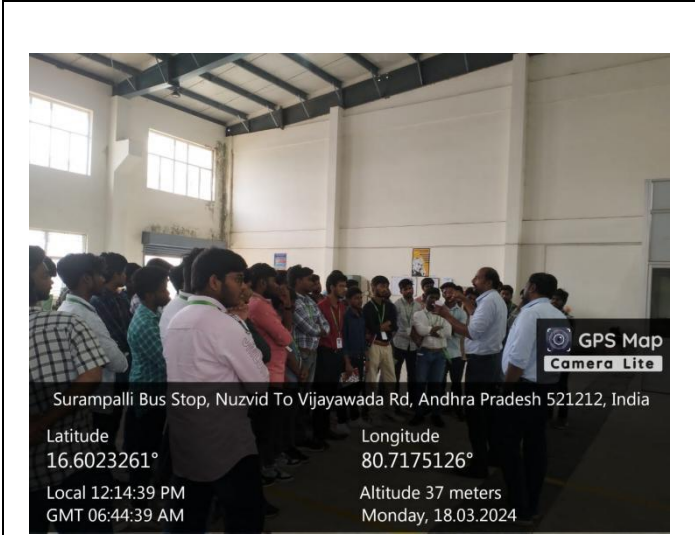
Students listening to the instructins of instructor at machine shop

Photographs: The following are the photographs of Industrial Visit of IV Semester A-Section Students to M/s CIPET, Surampalli, Vijayawada.