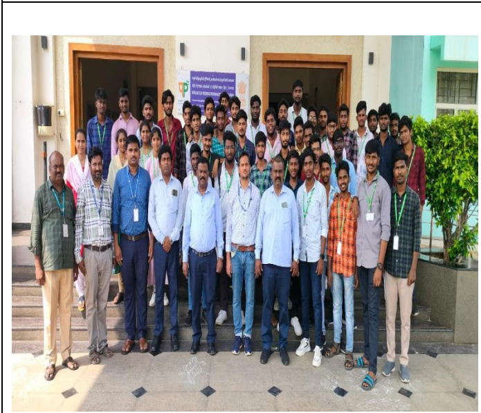
IV Semester A&B section students group photo in front of Main Building at M/s CIPET, Surampalli