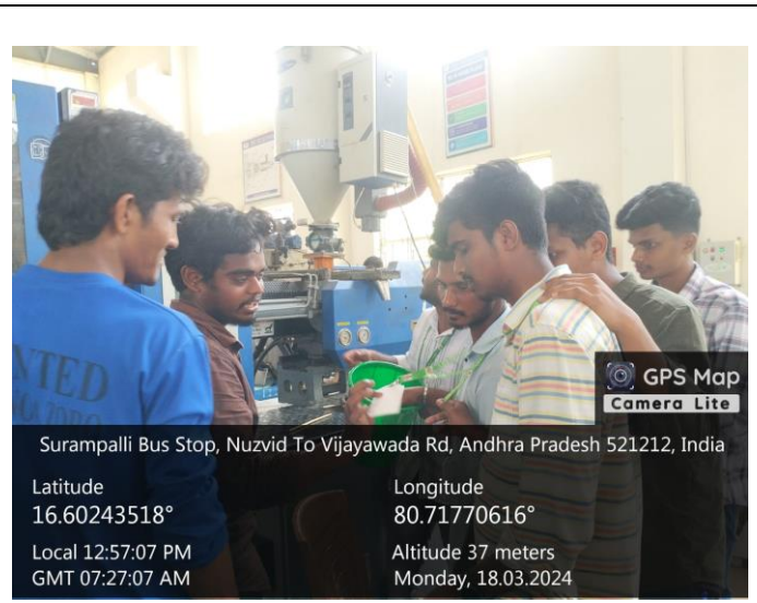
CIPET faculty giving instructions to students at workshop